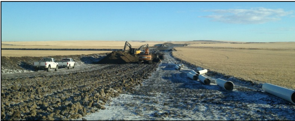
Redland Pipeline Nearing Completion