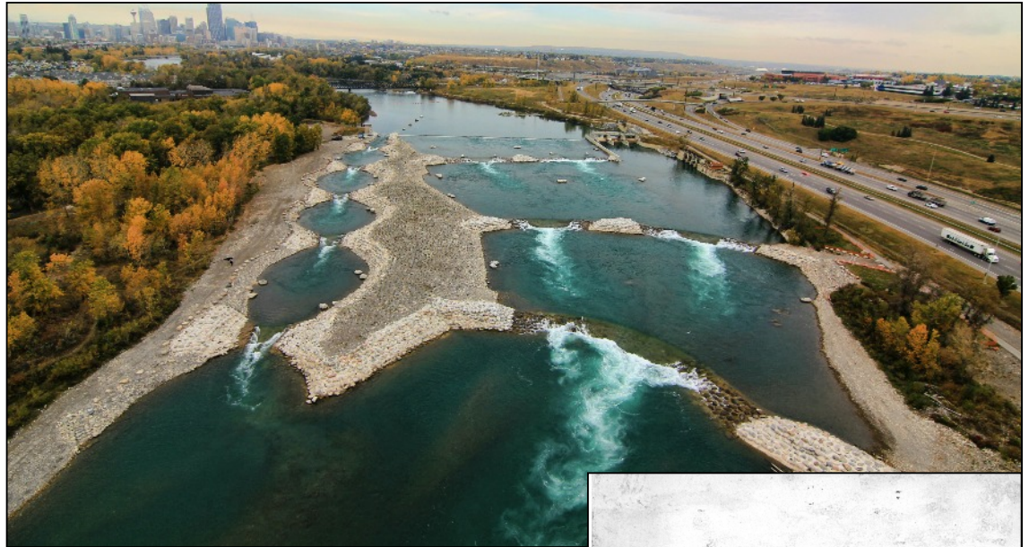
Harvie Passage

The Calgary Weir is an integral part of the Western Irrigation District's water diversion from the Bow River, approximately 3 km east of downtown Calgary. The entire weir has now been redesigned to foster safer recreational use by paddlers, and to improve fish habitat. The development of this newly named "Harvie Passage" was a partnership project between Parks Foundation Calgary, the Calgary Foundation, The City of Calgary and The Government of Alberta. The