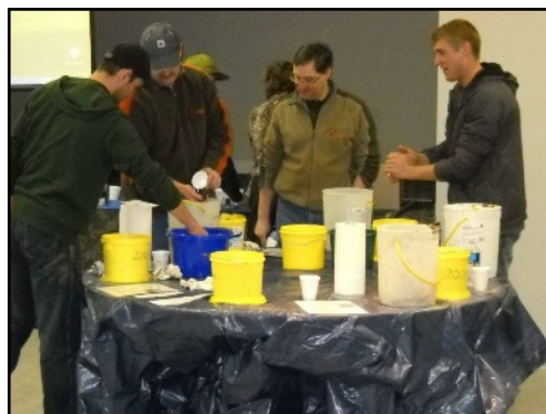
Irrigation IQ Participants at a Soil Texturing Station

On February 29, approximately 25 Western Irrigation District rate payers gathered at the Strathmore Travelodge for the Farmer's Meeting. The WID hosts this event annually as an opportunity to have dialogue between water users and WID staff. At this meeting, the WID discussed their capital and financial plans for the future.