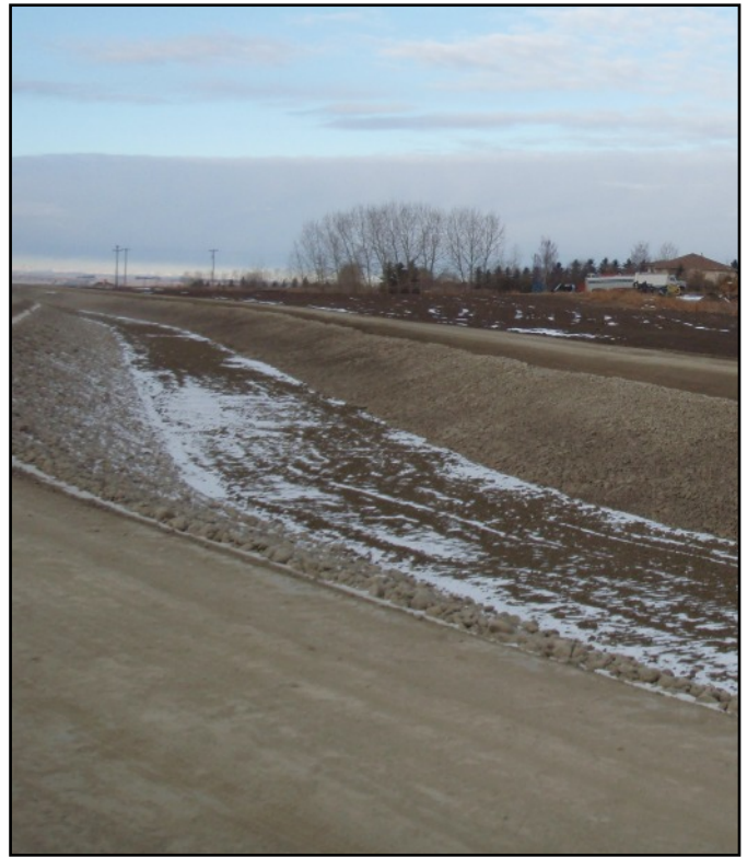
Rehabilitated Section of A Canal

Hemsing indicated, "Planning for next year's rehabilitation projects, which will commence after the irrigation season this fall, is well underway." Next winter, the Stoodley pipeline will be installed near Nightingale, and another 12km reach of Secondary A canal rehabilitation is being designed.